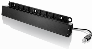
Lenovo® USB Soundbar