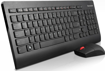
Lenovo® Ultraslim Wireless Keyboard and Mouse Combo